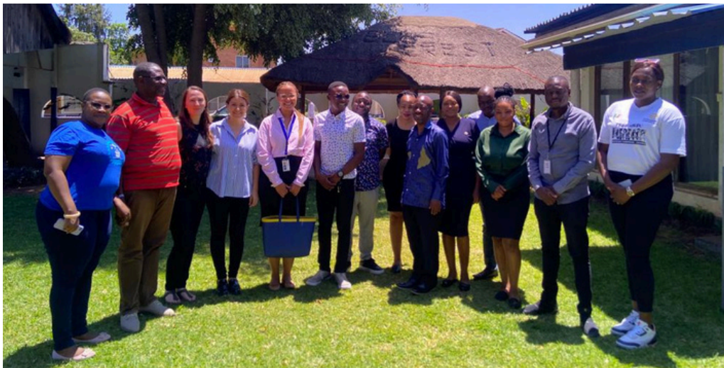
RAFIP members with a representative from the EU

Thank you to CISU for making this possible.