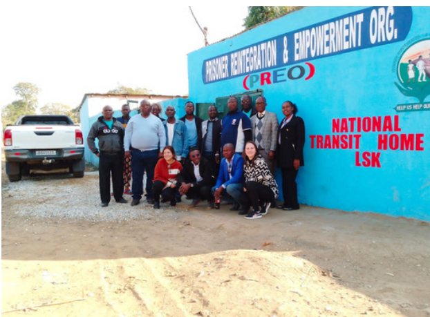
Visit to Transit Centre for formerly incarcerated run by PREO