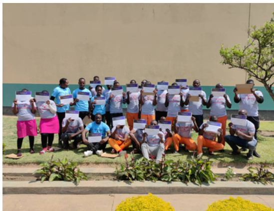
Inmates and officers from 3 Kabwe Correctional Centres who completed the 10-day Support Group Training