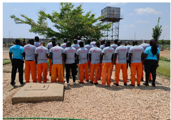
Inmates and officers from 2 Mwembeshi Correctional Centres who completed the 10-day Support Group Training