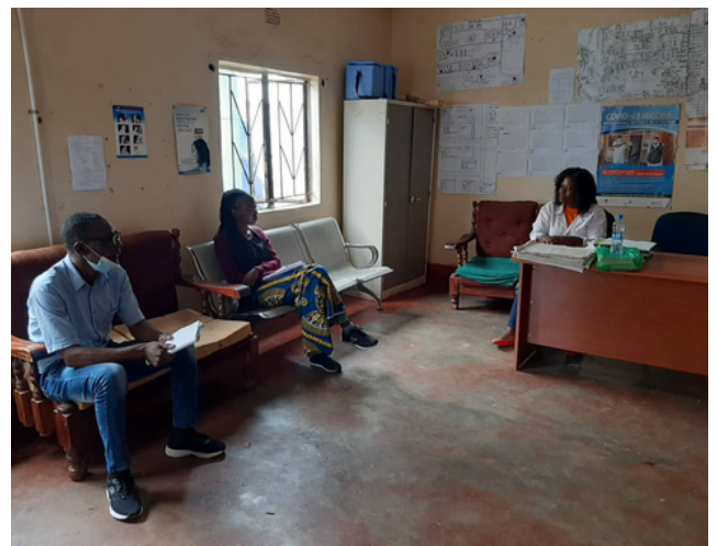
Monitoring Visit by Ubumi and PFF staff at Kabwe Medium Correctional Centre