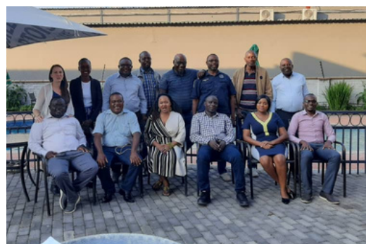
2-day workshop at Grand Palace Hotel in Lusaka for PHAC partners hosted by Ubumi