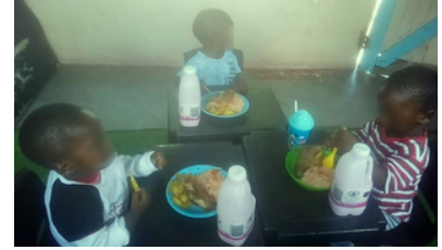
Christmas lunch at Kabwe Female Facility donated by Ubumi and PFF