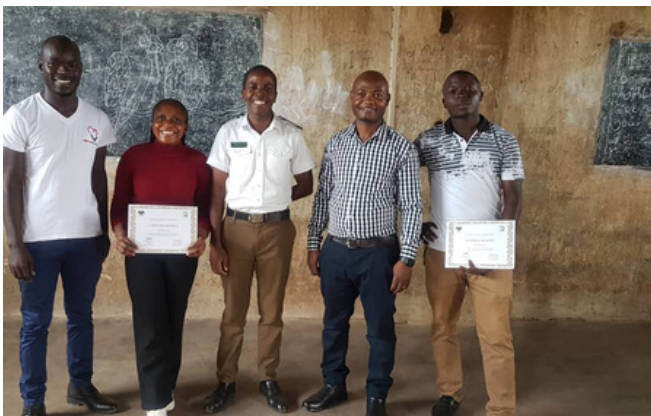
ZCS Officers who completed the HIV training with Ubumi's officer, ZCS Offender Manager and the facilitator from Chipata District

Thank you to PEPFAR for making this possible.