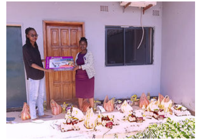
Monthly food and hygiene donation for the children, pregnant and breastfeeding women as well as seriously ill women by Ubumi.