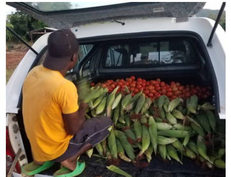
Trainee selling farm produce at the market in Chipata as part of the entrepreneurship training