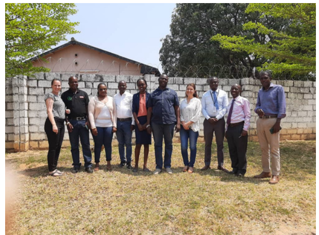
RAFIP meeting at Ubumi's office