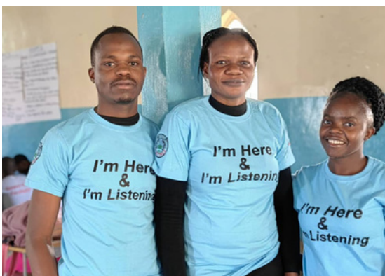
ZCS officers from Kabwe Correctional Centres who completed the 10-day Support Group Training facilitated by Ubumi

In 2023 we developed our own draft support group guidelines specifically to be used in closed settings like prisons. We then trained inmates and officers as Support Group Facilitators to enable them to run support groups for their peers. We trained 62 inmates (male and female) and 15 officers in Copperbelt, Lusaka and Central Provinces. 27 support groups were formed after the trainings. and the work will continue..