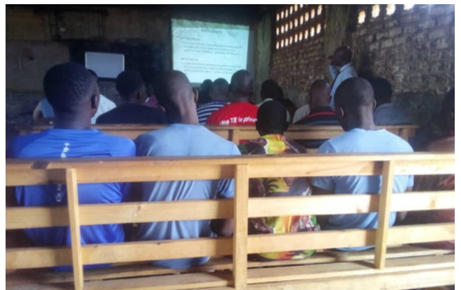
HIV and AIDS Workshop in Chipata Male Correctional Centre