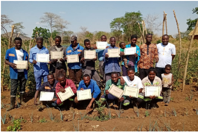
Graduation for the first group of trainees in 2023

We wish to thank CISU and PEPFAR for their support.