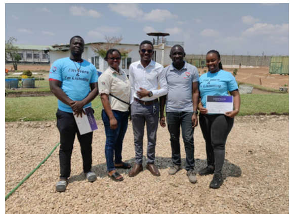
ZCS officers from Mwembeshi Remand Correctional Centre with ZCS HQ Mental Health Focal point, Ubumi's Senior Mental Health Advisor and Ubumi's Mental Health Specialist