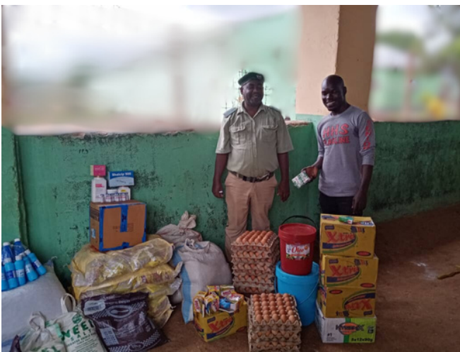
Monthly food and hygiene delivery at Chipata Male Correctional Centre

We wish to thank CISU - Civil Society in Development, PEPFAR as well as the private foundations and individual supporters. This would not be possible without your vital support.