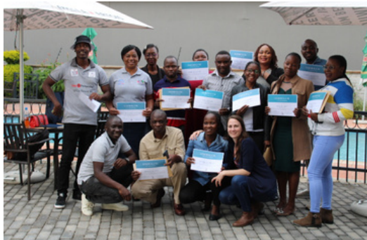
Workshop for ZCS Health staff on the ZCS Health Strategic Plan, Infectious Diseases and Nutrition in Lusaka

The project is implemented as a collaboration between Ubumi DK, Ubumi ZM and Prisoners' Future Foundation. We wish to thank CISU - Civil Society in Development for sponsoring this important intervention.