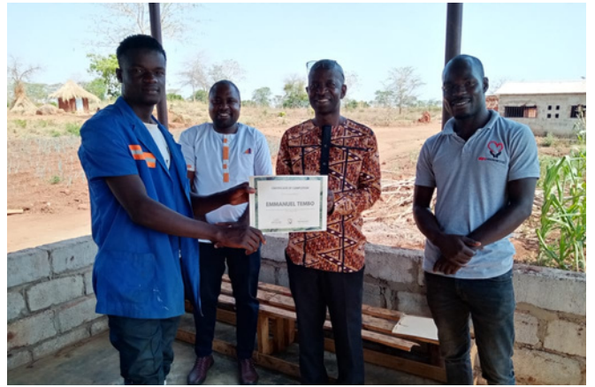
Deputy OIC from Chipata male Correctional Centre, Extension officer and Ubumi's Farm Manager handing over certificates to the graduates