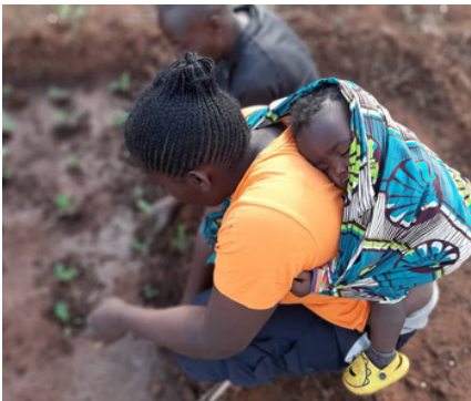
Trainees transplanting rape