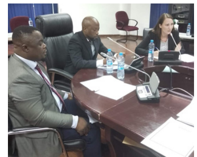
Ubumi's Country Coordinator and ActionAid Staff at Parliament