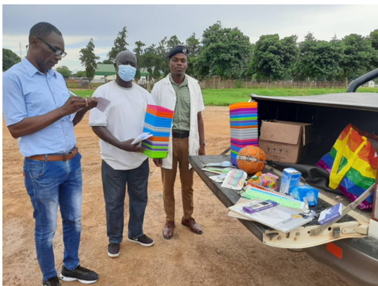
Donation of educational materials and lunch boxes for juveniles in Kabwe Medium Correctional Centre where Ubumi and PFF run nutritional and educational activities

BUPL and Jubilæumsfonden supported with various educational materials, including art and ICT. The inmate volunteers also make sure that recreational activities take place e.g. football and chess.